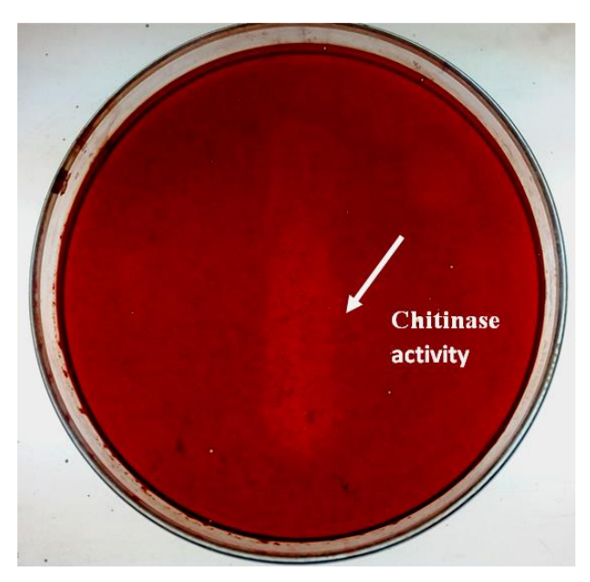
Figure 1: Primary screening of hydrolysis of chitin

In the present study, the strain SETB16 was screened for its chitinase activity. On the basis of colloidal chitin degradation, (Fig 1) a maximum of (1 cm) zone of clearance was observed, in the primary screening. The secondary screening was done in a suitable production media and the culture conditions were optimized (Graphs 1 to 3).